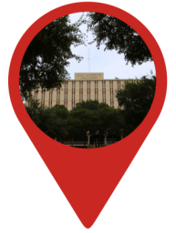
San Antonio College