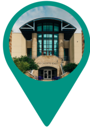
Palo Alto College