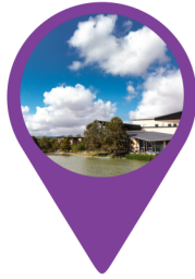
Northwest Vista College