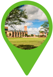
Northeast Lakeview College