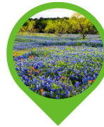
TEXAS HILL COUNTRY