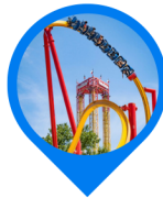
SIX FLAGS FIESTA TEXAS