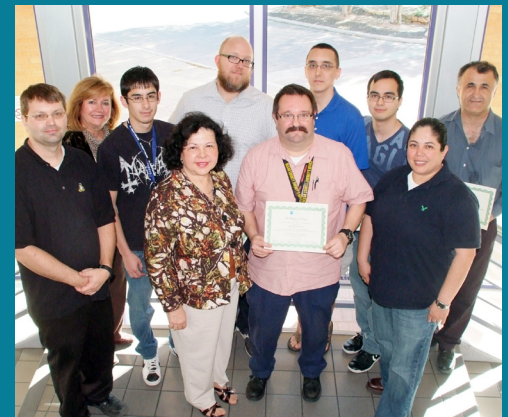
2012 Cyber Tigers Team pictured with faculty