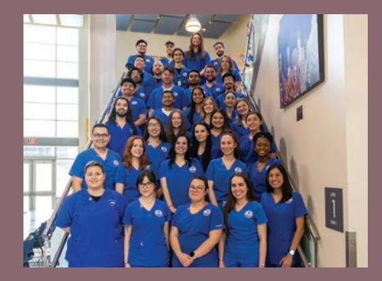
On May 9, 2024, the Radiology program held its pinning ceremony. Over 30 students participated in the event held in Turbon Center, Room 216. Graduates of the program were celebrated with pins, certificates, and cupcakes.