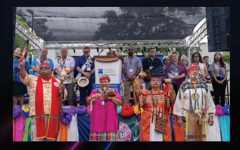
The Tehuan Band of Mission Indians of San Antonio recite a blessing at the opening ceremony.