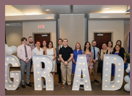
The Bowden Alumni Center was decorated with balloons to celebrate the Spring 2024 Physical Therapy graduates at their pinning ceremony on May 13, 2024. The event marked the student's program completion as faculty members led them with an oath.