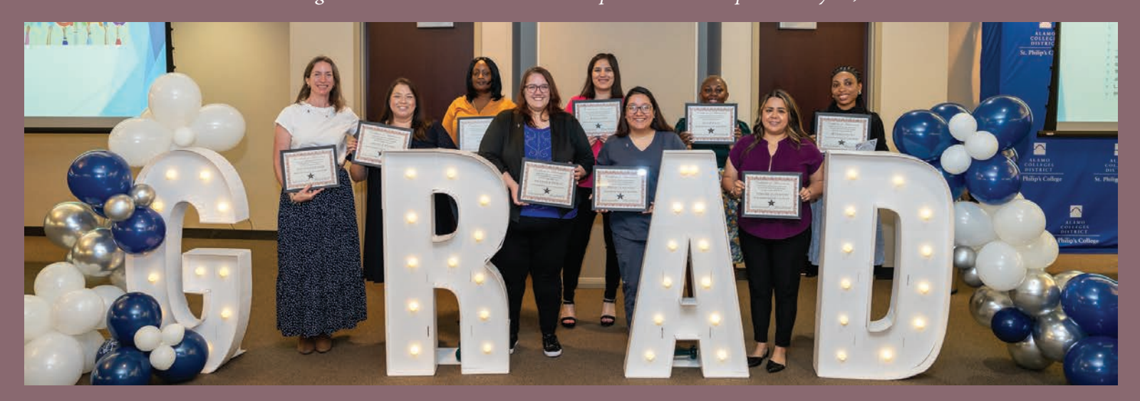
The Health Information Technology program held a ceremony on May 13, 2024, to congratulate their graduating students with a certificate and pin. At the event, faculty members commended their graduates on their hard work during the program.