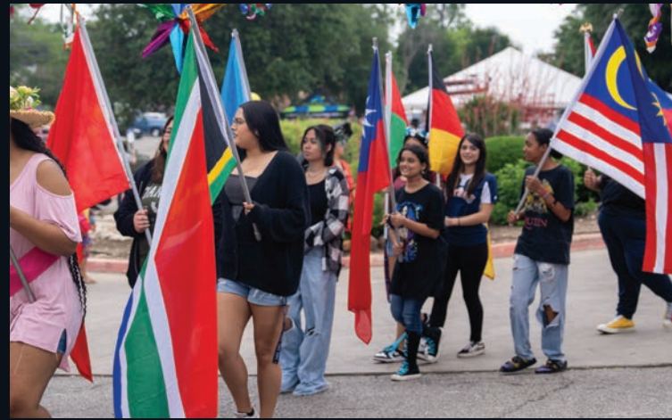
St. Philip's College's Early College High School students carry flags from various countries and cultures during the parade.