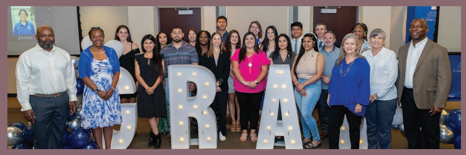
The Occupational Therapy Assistant program celebrated its students' success with an event in the Bowden Alumni Center. Family members watched as the soon-to-be graduates took their oath and were presented with a pin on May 13, 2024.