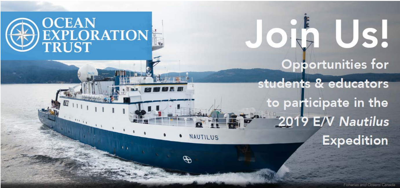
Fisheries and Oceans Canada

Opportunities for students & educators to participate in the 2019 E/V Nautilus Expedition