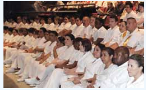
LVN students at a pinning ceremony.

In San Antonio, the overall licensure pass rates for the LVN program between 2005 and 2009 increased at an average rate of nearly three percentage points yearly, with an increase in licensure pass rates of six percentage points occurring between 2008 and 2009. The program's increase in pass rates between 2005 and 2009 was a big factor in the Finalist recognition because state and national trends both declined by approximately one percentage point per year over the period.