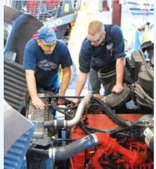
Diesel technology students at work.