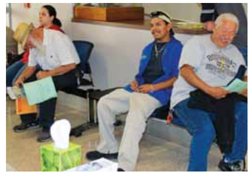
VITA serves more than 1,700 citizens annually.

St. Philip's College VITA volunteers processed $3,610,827 in refunds for low-to moderate-income clients in 2010, serving 1,975 local clients. "The staff members at the college load our software to a server, they maintain our computers, and now they are ensuring a very professional environment for our first venture in free classroom instruction for the volunteer tax preparer. We offer excellent volunteer opportunities to scholars and community members."