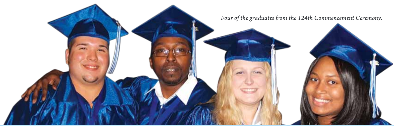
Four of the graduates from the 124th Commencement Ceremony.