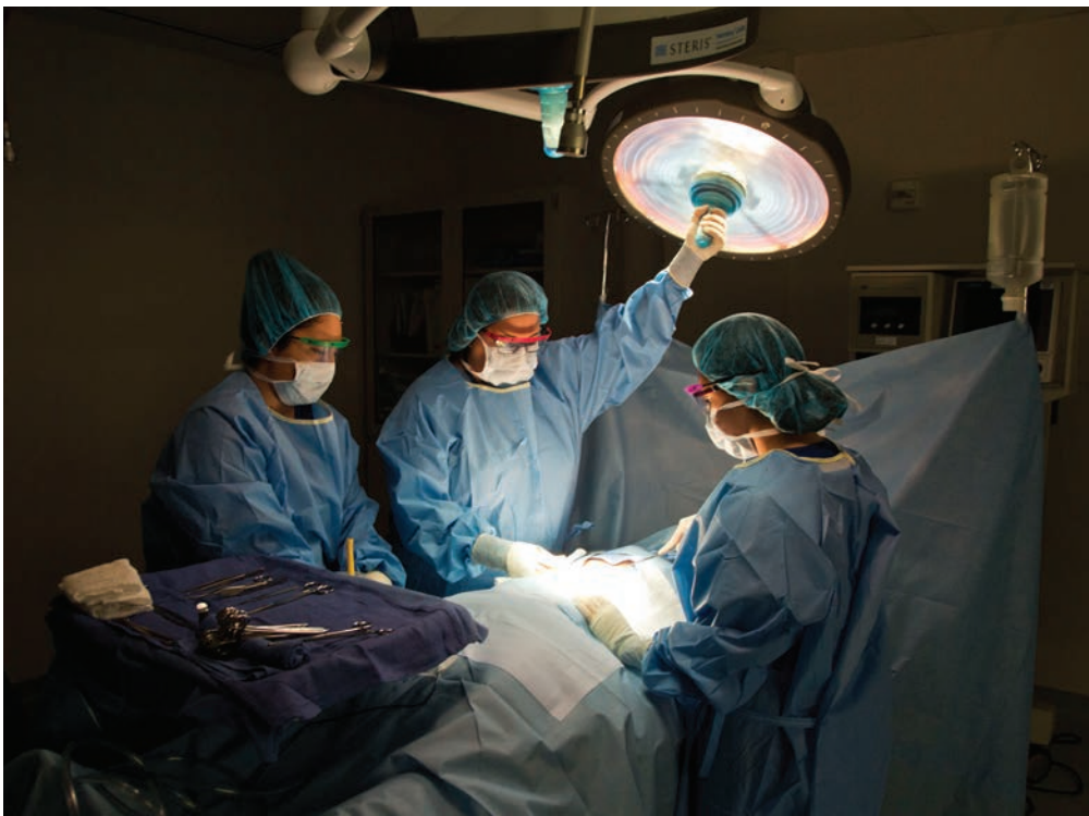
On-campus, students learn in a lab that is identical to an operating room of any Level 1 trauma center. They supplement classroom instruction with clinical rotations at a number of area medical centers.

Students complete many procedures during their clinical rotations in area hospitals, including Santa Rosa Medical Center. After successfully passing a national-level Certified Surgical Technologist Exam, program alumni are ready for employment. Certified surgical techs are qualified to assist the surgical team during surgery. They may work as a surgical scrub person, passing instruments and surgical supplies to the surgeon, assist the registered nurse during the surgical procedure, or perform functions in other areas of the operating room department.