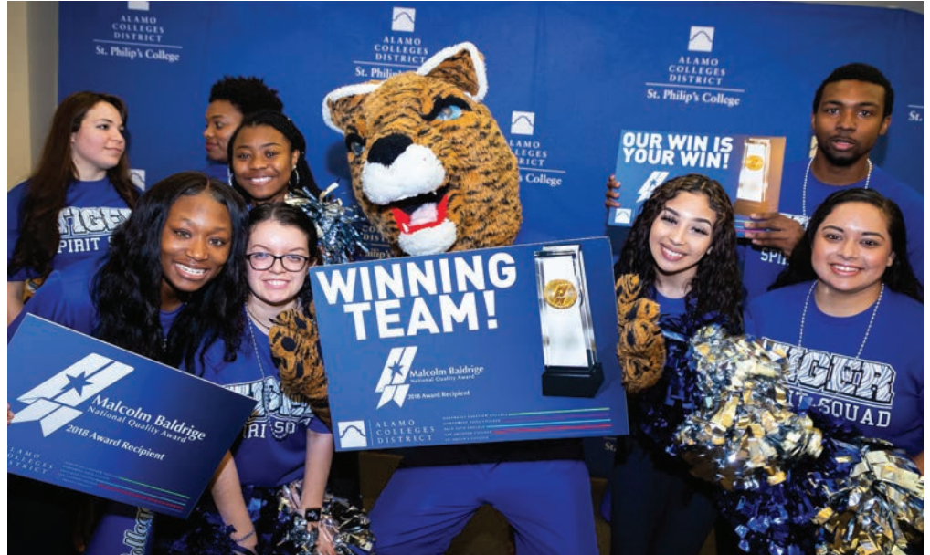
SPC celebrated the Baldrige Award win with a raucous party and the dedicated enthusiasm of Phil the Tiger and the Spirit & Pride Crew.

ACD's Students First culture focuses on removing barriers to higher education for potential, current, and former students. The district graduation rate is first among all community college districts in the state. Each college starts to engage students as early as middle school with high school programming. The district's 16 Early College High School Programs provide dual-enrollment courses and a degree plan. Ninety percent of these students graduate high school with an associate's degree. The colleges use innovative programs including College Connection to reach high school students and their families and provide support services for continuing enrollment, financial aid,