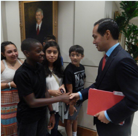
The Honorable Julián Castro speaks with St. Philip's College MicroSociety students.