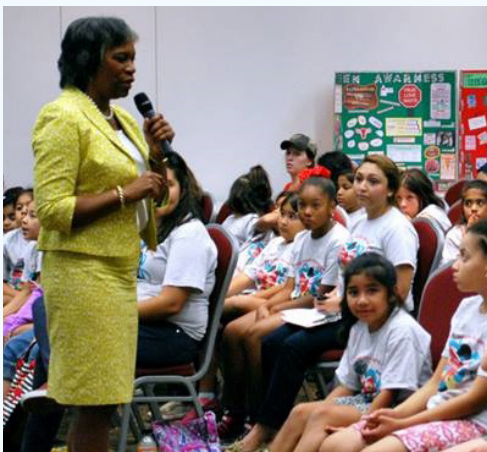
St. Philip's College hosted its second season of Jessica's Project.

On July 16, in the St. Philip's College Heritage Room, the college hosted another season of Jessica's Project teen and unplanned pregnancy awareness events. The half-day of multidisciplinary learning was staffed by community agencies and the college's science degree candidates. The event engaged 100 visiting students from Girls Inc. of San Antonio as part of SPC's larger commitment to transforming socio-economic conditions for residents surrounding its main campus by improving education opportunities. Jessica's Project is a series of annual classroom events that have engaged hundreds of nutrition, chemistry, anatomy, physiology, biology and health sciences students with the community to address a health issue through an evidence-based program.