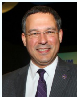
U.S. Senator John Cornyn