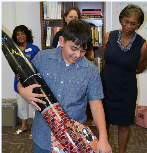
St. Philip's College faculty support in rocketry, manufacturing, environmental science among others.

Movement Enrichment (SLAM) program. Funding for SLAM was provided by Eastside Promise Neighborhood Out of School Summer Programming and U.S. Department of Education Strengthening Historically Black Colleges and Universities funding. Among the 60 recognized SLAM participants were 20 inventors ages 11-15 who completed nine weeks of learning both the practical, business, entrepreneurial and intellectual property elements of basic research using software from the U.S. Patent and Trademark Office in a number of science, technology, engineering and math disciplines studied during three weeks this summer at St. Philip's College and during five weeks at both the academy and the community center. The aspiring scientists were also freshly inspired from a field research visit to NASA in Houston. Before awards for their achievements were presented, the SLAM inventors competed hands-on in robotics and in a