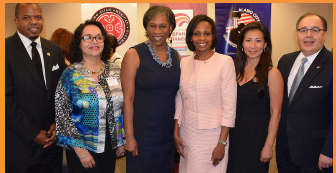
The San Antonio Hispanic, the Alamo Asian American and the Alamo City Black Chambers of Commerce each cosponsored the event.