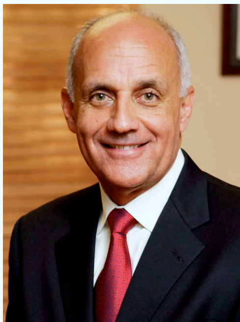
Dr. Richard Carmona, 17th Surgeon General of the United States (2002-2006).