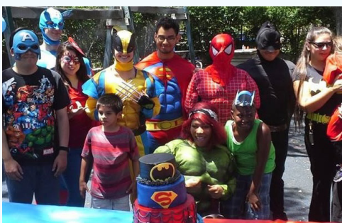
St. Philip's College student school supply drive and Super Hero Party.

On Aug. 16 at Davidson Respite House, St. Philip's College alumni and current degree candidates gave back by donning costumes in 108-degree heat to support a school supply drive and Super Hero Party for the young