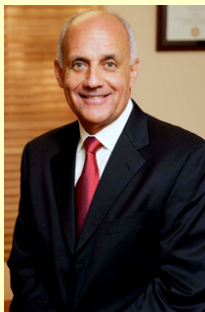
Dr. Richard Carmona 17th Surgeon General of the United States October 9, 2014, 11 a.m. Watson Fine Arts Center

In 2002, Dr. Richard Carmona was nominated by the President and unanimously confirmed by the United States Senate to become the 17th Surgeon General of the United States. Dr. Carmona was selected because of his extensive experience in public health, clinical sciences, healthcare management, preparedness and his commitment to prevention as an effective means to improve public health and reduce healthcare costs, while improving the quality and quantity of life.