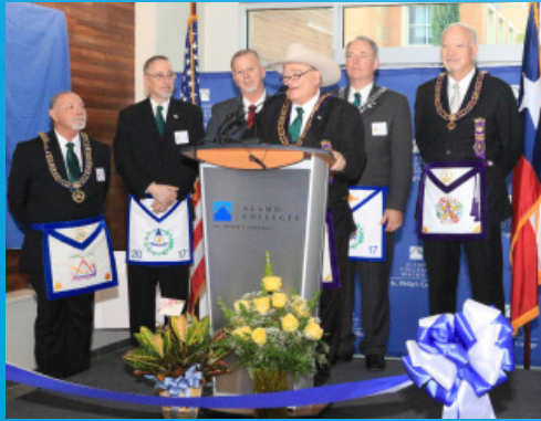
A cornerstone ceremony was held in conjunction with the grand opening of the Turbon Student Center. A cornerstone ceremony for the GSVOTC was held earlier this year.