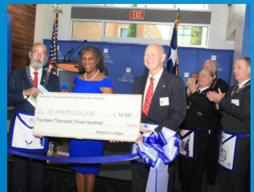
Area Masonic Lodges added $14,300 to the Masonic Scholarship for Skilled Trades, a longtime source of funding for students pursuing careers and licensure in vocational trades.