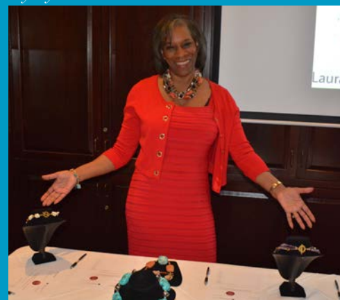
Dr. Loston's jewelry, donations and Fiesta medals contributed to the $7,500 raised in a single evening.