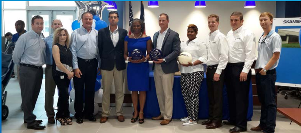
Bowling balls, presented by Pfluger Architects and Skanska USA, commemorate the grand opening of the Turbon Student Center.